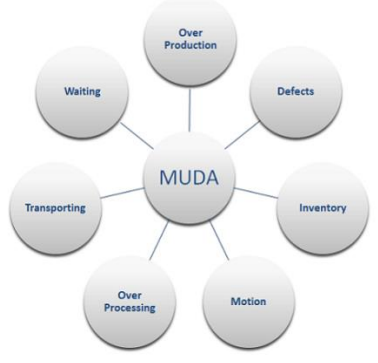
Fig 1.1: Seven Wastes – Overproduction, Defects, Inventory, Over Processing, Transporting, Waiting, Motion.

practiced throughout an organization, it would result in "zero inventory". Autonomation means automating a process to include inspection.