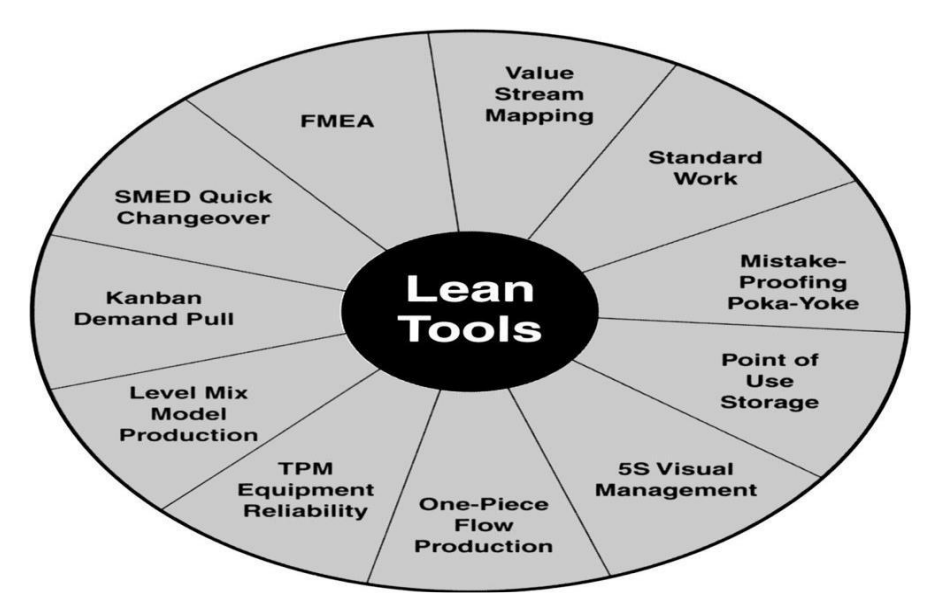
Figure 1.2: Lean tools

In non-manufacturing sector, Olatunji (2008) examined the exportation of lean to the Nigerian construction industry by exploring practitioners' extent of knowledge and scope of application of lean techniques. Tai (2012) explored the implementation of lean operations (LO) in a gas company as a way of using Total Quality Management (TQM) and Just-In-Time (JIT) manufacturing to contribute to the organization's profitability and competitive advantage. Uzochukwu and Ossai (2016) adapted lean production system in the oil and gas industry with a view to resolving severe organizational performance problems in the sector.